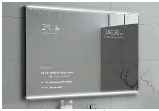
Fig 1.1 - Smart Mirror

This magic mirror is easily allowed to access and control the home automation and security system. And we will be controlling music system, along with controlling it will be useful for security purposes such as fire detection, unauthorized entry and provides overall security for home. The user needs to put their respective fingerprint to unlock the device. The smart mirror is consisting raspberry pi and firebase cloud technology along with micro controllers and relays.