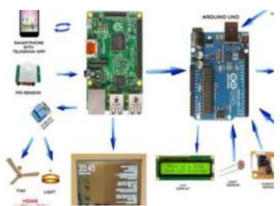
Fig- 4.1 - Architecture of Smart Mirror System

The proposed smart mirror device gets activated when the authorized user unlocks it using authentication methods such as face recognition or using bio metric finger sensor.