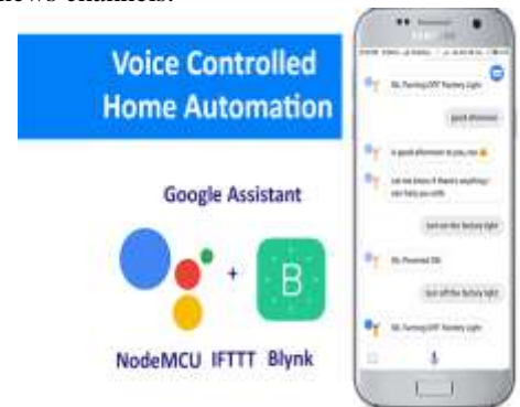
Fig 4.2 - User Communication with Chatbot

The home screen displays the control panel and the music system control such as volume, pause and play using air gesture technology. IR touch overlay screen technology is used to the display which is on the bottom, next to mercury mirror, the IR Touch Overlay is on top. From there we will cover the overlay with a frame to hide it from view and to hold the smart mirror together tightly. Time, Date, weather details and news are fetched from online websites as well as from live news channels.